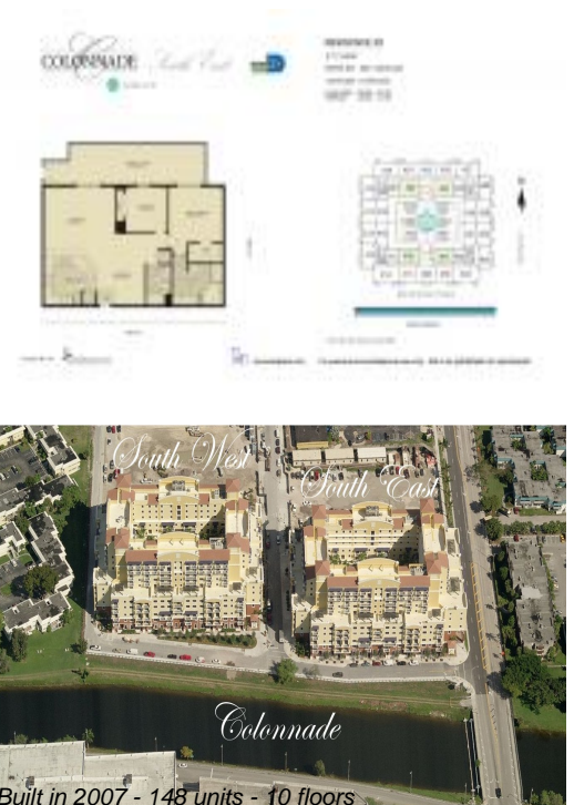
Built in 2007 - 148 units - 10 floors