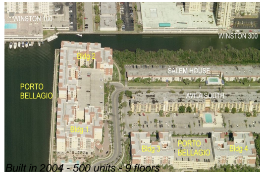
Built in 2004 - 500 units - 9 floors