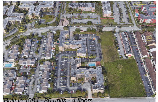
Built in 1984 - 80 units - 4 floors