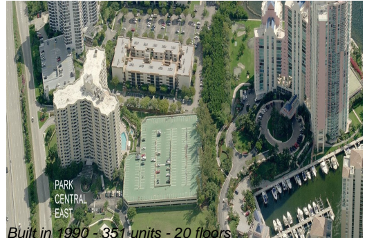
Built in 1990 - 351 units - 20 floors

The above valuated price is a baseline figure that does not take into account any specific renovation, upgrade, split, merge, or deterioration of the unit.