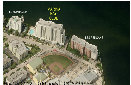
Built in 2002 - 100 units - 13 floors