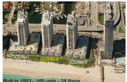
Built in 1993 - 165 units - 28 floors