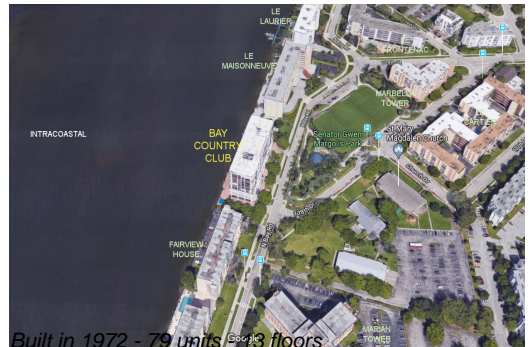
Built in 1972 - 79 units - 30 stories