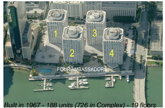
Built in 1967 - 188 units (726 in Complex) - 19 floors