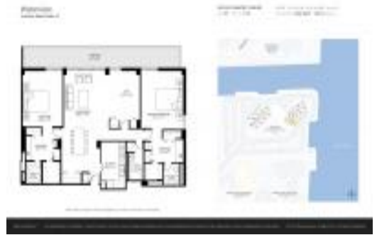
Built in 1981 - 394 units - 23 floors

The above valuated price is a baseline figure that does not take into account any specific renovation, upgrade, split, merge, or deterioration of the unit.