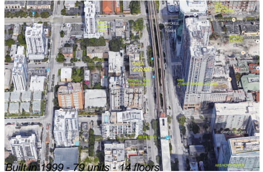
Built in 1999 - 79 units - 14 floors