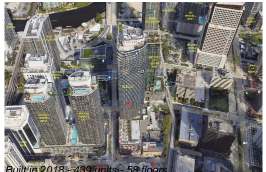
Built in 2018 - 439 units - 58 floors