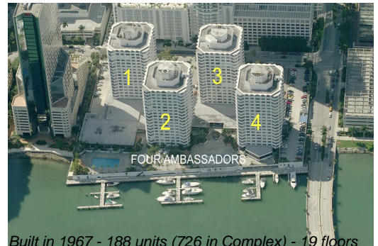
Built in 1967 - 188 units (726 in Complex) - 19 floors