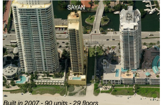
Built in 2007 - 90 units - 29 floors