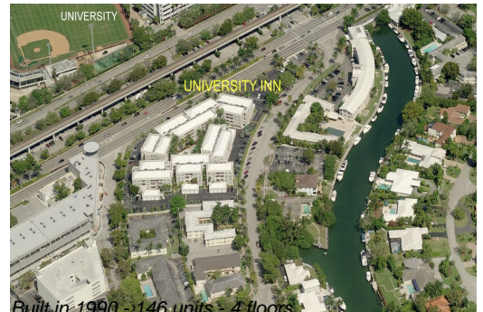
Built in 1990 - 146 units - 4 floors