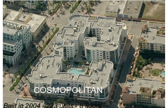
Built in 2004 - 223 units - 8 floors