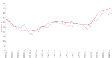
Alaqua at Aventura vs Aventura