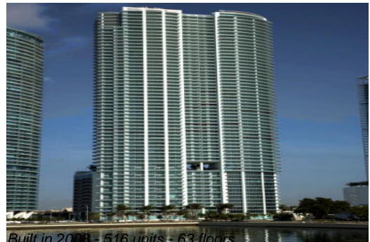
Built in 2008 - 516 units - 63 floors