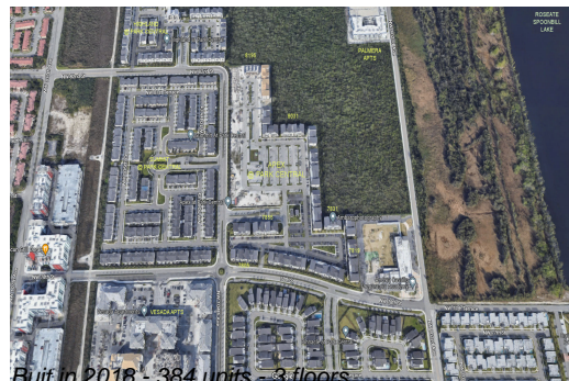
Built in 2018 - 384 units - 3 floors