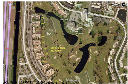
Build in 1981 - 436 units - 4 floors