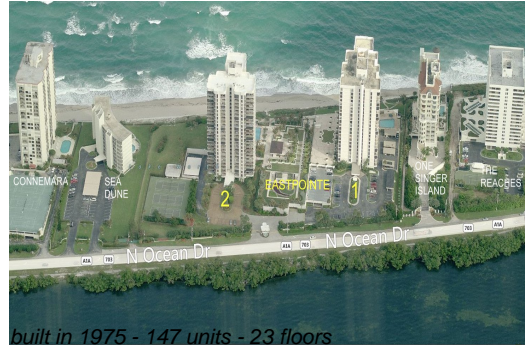
built in 1975 - 147 units - 23 floors

The above valuated price is a baseline figure that does not take into account any specific renovation, upgrade, split, merge, or deterioration of the unit.