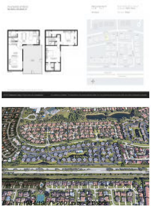
Built in 1984/1987 - 200 Units - 2 floors