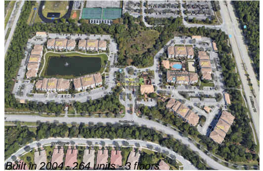
Built in 2004 - 264 units - 3 floors