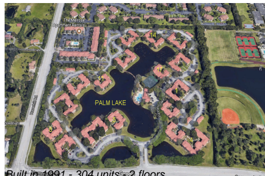
Built in 1991 - 304 units - 2 floors