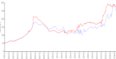
Waterside Village vs Hypoluxo