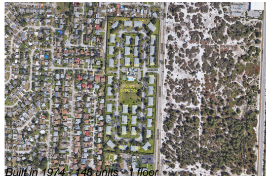
Built in 1974 - 148 units - 1 floor