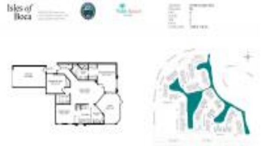
Architectural drawings showing site plan and floor plan details.