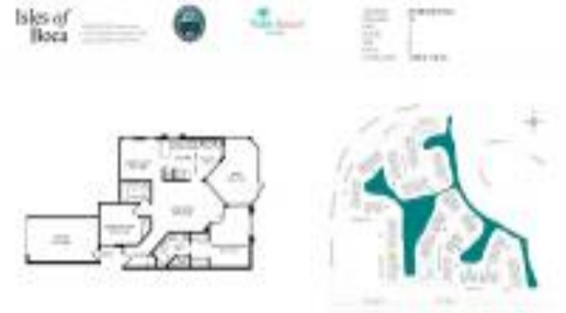
Architectural drawings showing site plan and floor plan details.