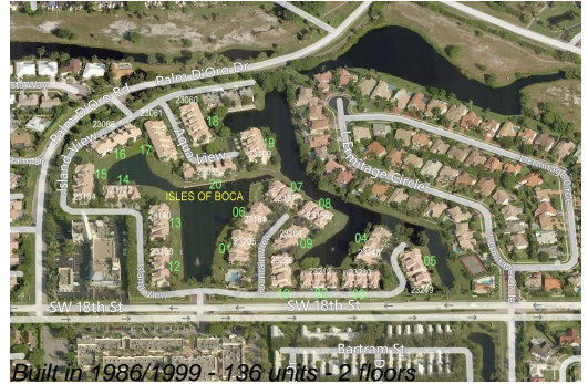
Built in 1986/1999 - 136 units - 2 floors