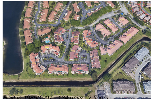
Built in 1985/1997 - 134 units - 2 floors