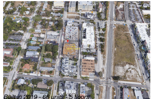
Built in 2019 - 66 units - 5 floors