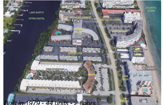
Built in 1979 - 44 units - 2 floors