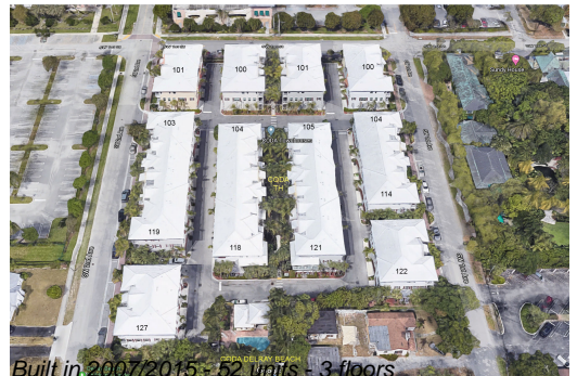
Built in 2007/2015 - 52 units - 3 floors