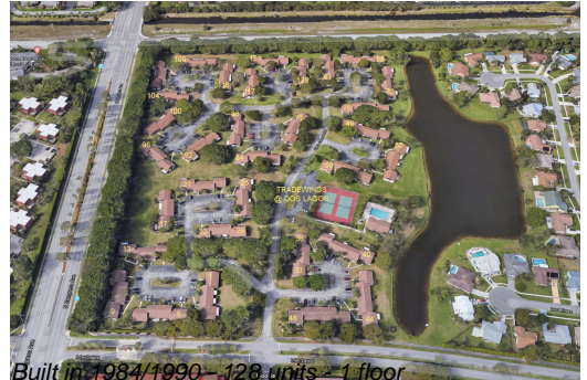
Built in: 1984/1990 - 128 units - 1 floor