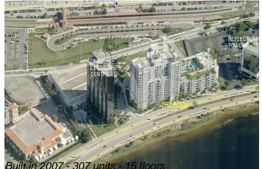
Built in 2007 - 307 units - 15 floors