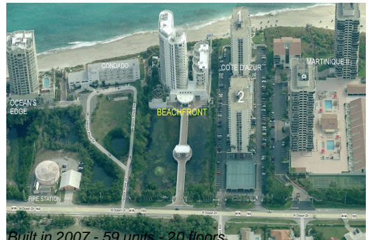
Built in 2007 - 59 units - 20 floors