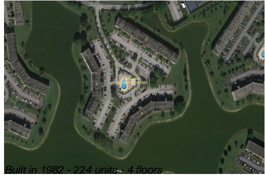
Built in 1982 - 224 units - 4 floors