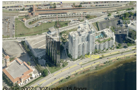
Built in 2007 - 307 units - 15 floors