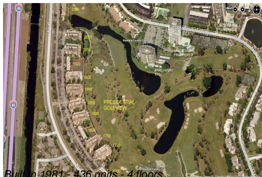
Build in 1981 - 436 units - 4 floors