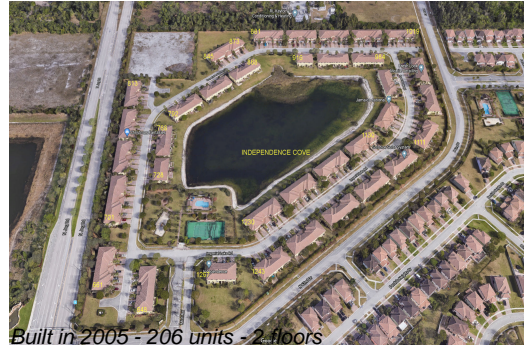
Built in 2005 - 206 units - 2 floors