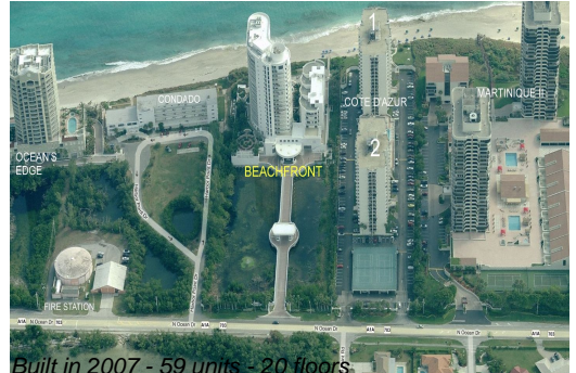
Built in 2007 - 59 units - 20 floors