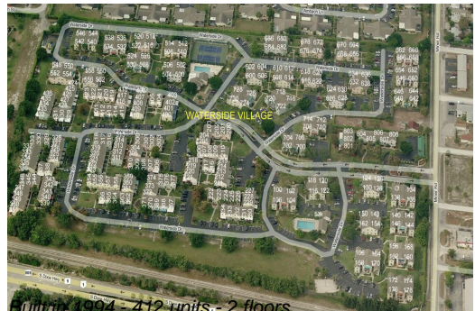
Built in 1994 - 412 units - 2 floors