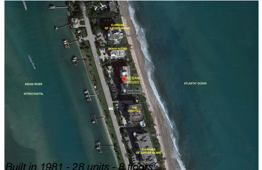
Built in 1981 - 28 units - 81,000 sq ft