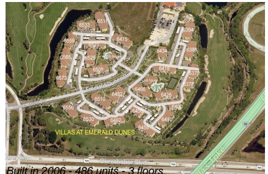
Built in 2006 - 486 units - 3 floors