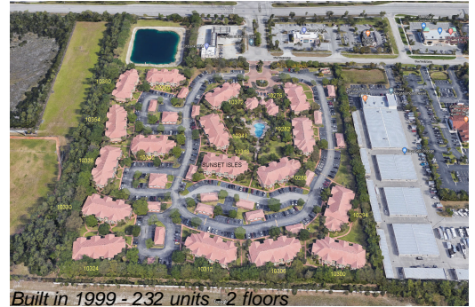
Built in 1999 - 232 units - 2 floors

MLS Number: A11686054 Status: Active Size: 784 Sq ft. Bedrooms: 1 Full Bathrooms: 1 Half Bathrooms: Parking Spaces: 2 Spaces, Guest Parking, Not Assigned View: Garden View Rental Price: $1,700 List PPSF: $2 Valuated Price: $217,000 Valuated PPSF: $277