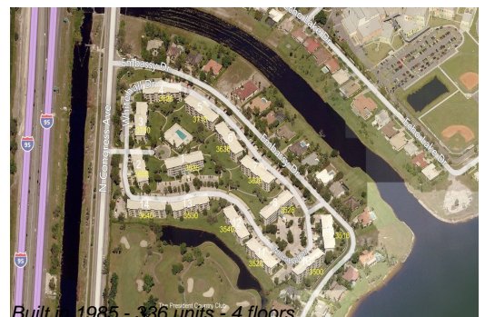
Built in 1985 - 336 units - 4 floors

West Palm Beach: $470/sq. ft. Palm Beach: $466/sq. ft.