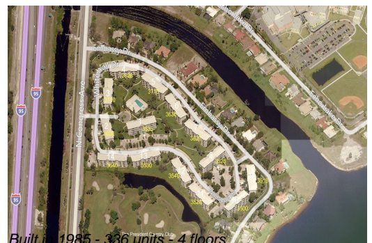
Built in 1985 - 336 units - 4 floors

West Palm Beach: $470/sq. ft. Palm Beach: $466/sq. ft.