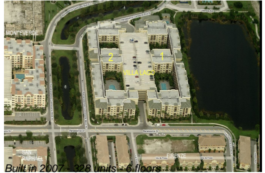
Built in 2007 - 328 units - 6 floors