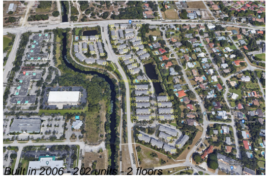
Built in 2006 - 202 units - 2 floors