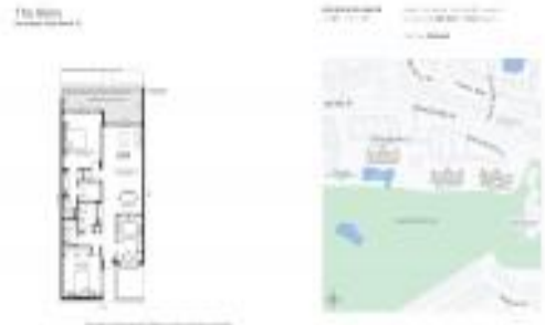
Built in 1980 - 168 units - 7 floors

6320 Boca del Mar Dr # 207 - 6320 Boca del Mar Dr, Boca Raton, FL, Palm Beach 33433