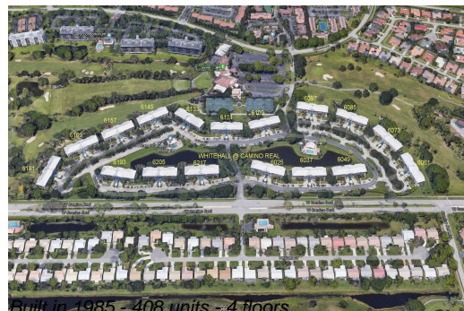
Built in 1985 - 408 units - 4 floors