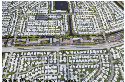
Built in 1979 - 152 units - 2 floors