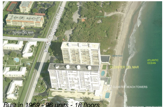
Built in 1969 ~ 96 units - 18 floors